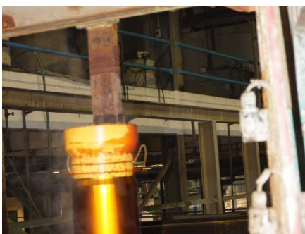
Photographs show (above) conventional return-type machines for mass production and (below) hoist lines at close range.